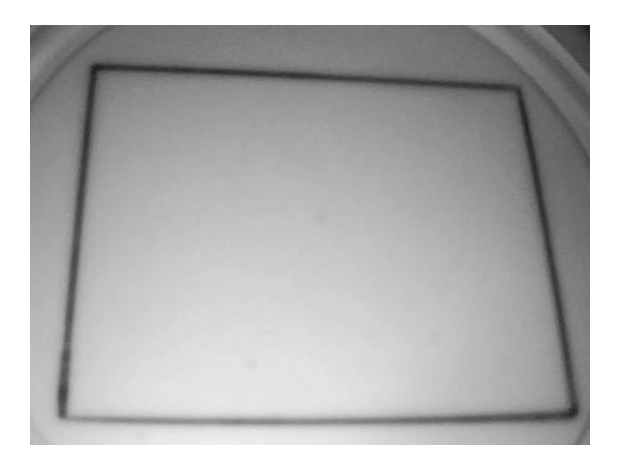
Fig. 2 Cloudy peritoneal fluid (digital picture)

telemedicine practice. Among the main errors are lack of data integrity and/or legal compliance, incorrect patients data, unreliable transmitted information and poor quality images. Practitioners have to be aware of these pitfalls, taking the appropriate countermeasures for making the patient consult effective and safe. Integration of a checklist to the telemedicine practice, adherence to privacy and confidentiality regulation (passwords, electronic signature, etc.), and several technical barriers (firewalls, filters, etc.) can help to achieve this objective [21].